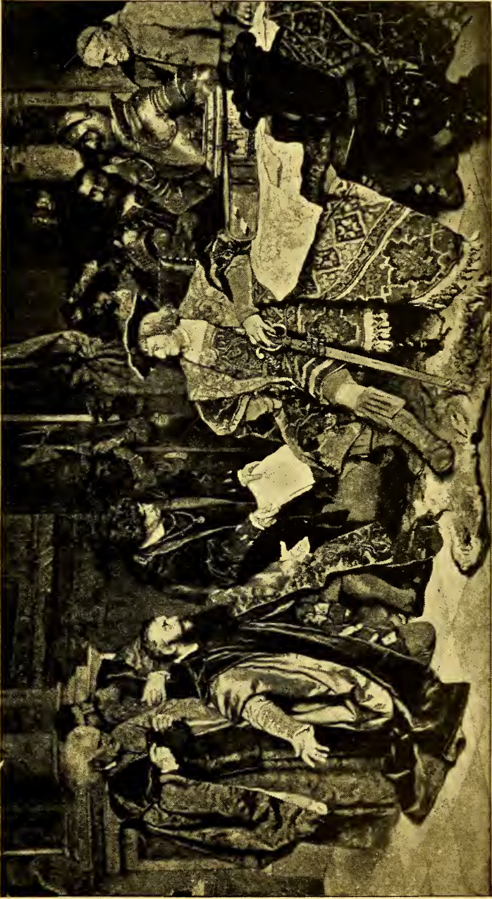
MAXIMILIAN RECEIVING A DELEGATION FROM VENICE.